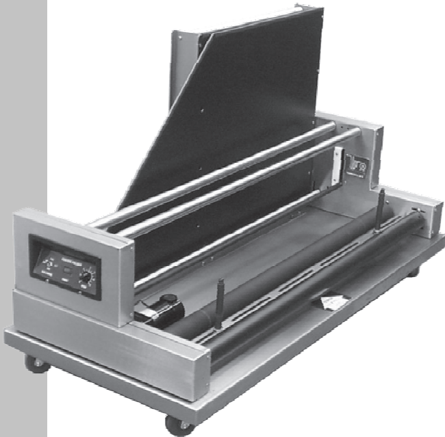
Shown As: CF-740 48" Centerfolder

WILL FIT MOST SEMI-AUTOMATIC AND AUTOMATIC APPLICATIONS