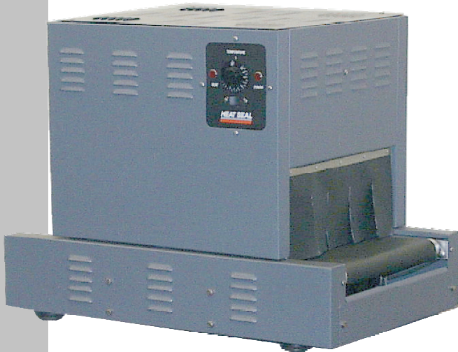
Shown As: T-110 With Silicone Belt

115 VOLT COMPACT, TABLE TOP SHRINK TUNNEL