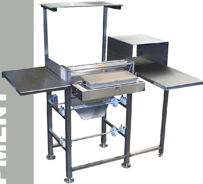
Shown With Optional Left Wing, Right Wing With Hood And Storage Shelf