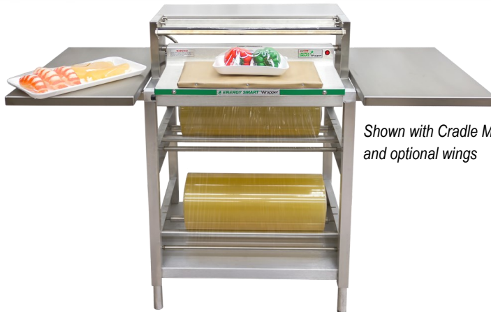
Shown with Cradle Mount and optional wings

ON DEMAND SEAL PLATE SIGNIFICANTLY REDUCES ENERGY CONSUMPTION