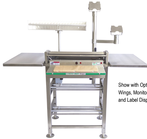
Show with Optional Wings, Monitor Mounts and Label Dispenser