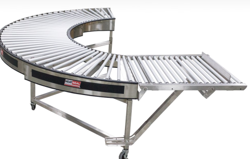
Model GTC180 Right Hand/Operator Side