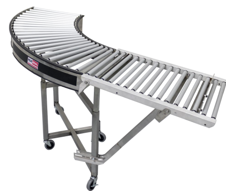
Model GTC90 Right Hand/Operator Side